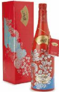
753 Champagne Collection 'Matta' 1992 Taittinger, Reims

Excellent level and appearance S 1 bottle (OCB) Per lot: € 120 – 160