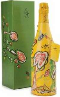
751 Champagne Collection 'Imai' 1988 Taittinger, Reims

Excellent level and appearance S 1 bottle (OCB) Per lot: € 120 – 160